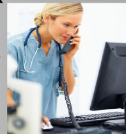
AHCP Call Center