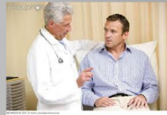
Your Doctor's office